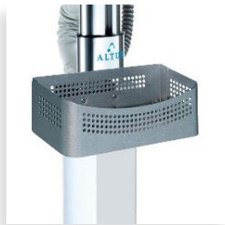
PT-HB-PL Utility basket, platinum finish