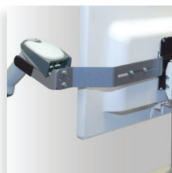
BCH-14 VESA mounted adjustable bar code holder, platinum finish