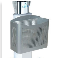
PT-HFH Utility basket, platinum finish