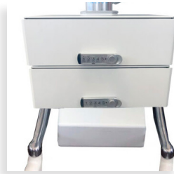
PT-DS2 Column mounted double drawer, white finish