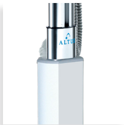
Vinyl Sleeve and Polished Aluminum Extrusion