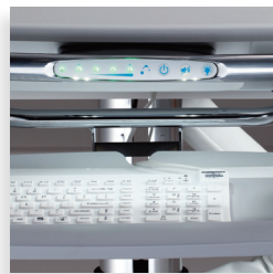
Keyboard LED Light