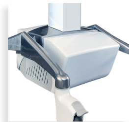
Power System Enclosure