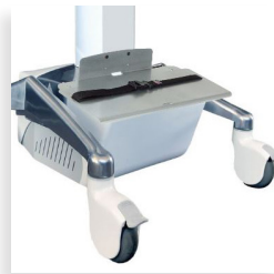
PT-MPS-6-PL Multi-purpose adjustable shelf, platinum finish