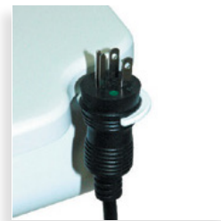
Coiled Power Cord Holder