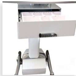
DSW Worksurface mounted single drawer, built in lock, white finish